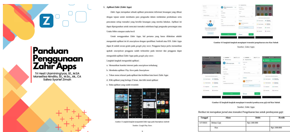
Figure 6. Zahir Apps Guide Book

After implementing Zahir Apps, the researcher created a guidebook as a research output that can help VOE's Bojonggede Mandiri in preparing its financial reports. For that, this guidebook can be used as a long-term reference in preparing financial reports for VOE's Bojonggede Mandiri and can also be used for other VOE's that still do not understand how to prepare financial reports. The following is a picture of the guidebook created by the researcher: