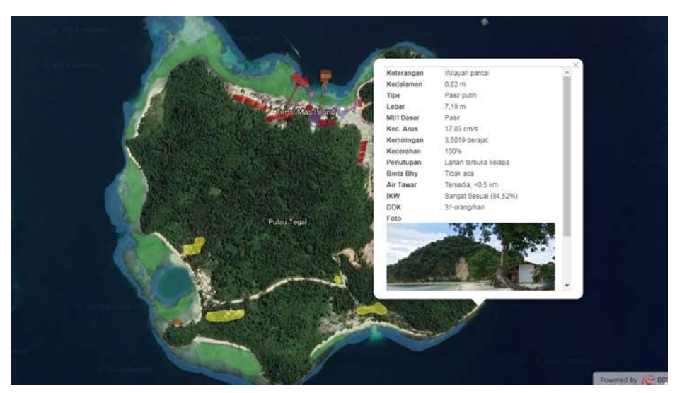
Figure 2. Display of GIS Map on Website